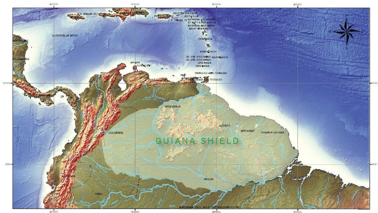
Figure 1: The Guiana Shield

Beyond that it is a region with still large numbers of indigenous communities who act as guardians of these tremendous ecological wealth. 5