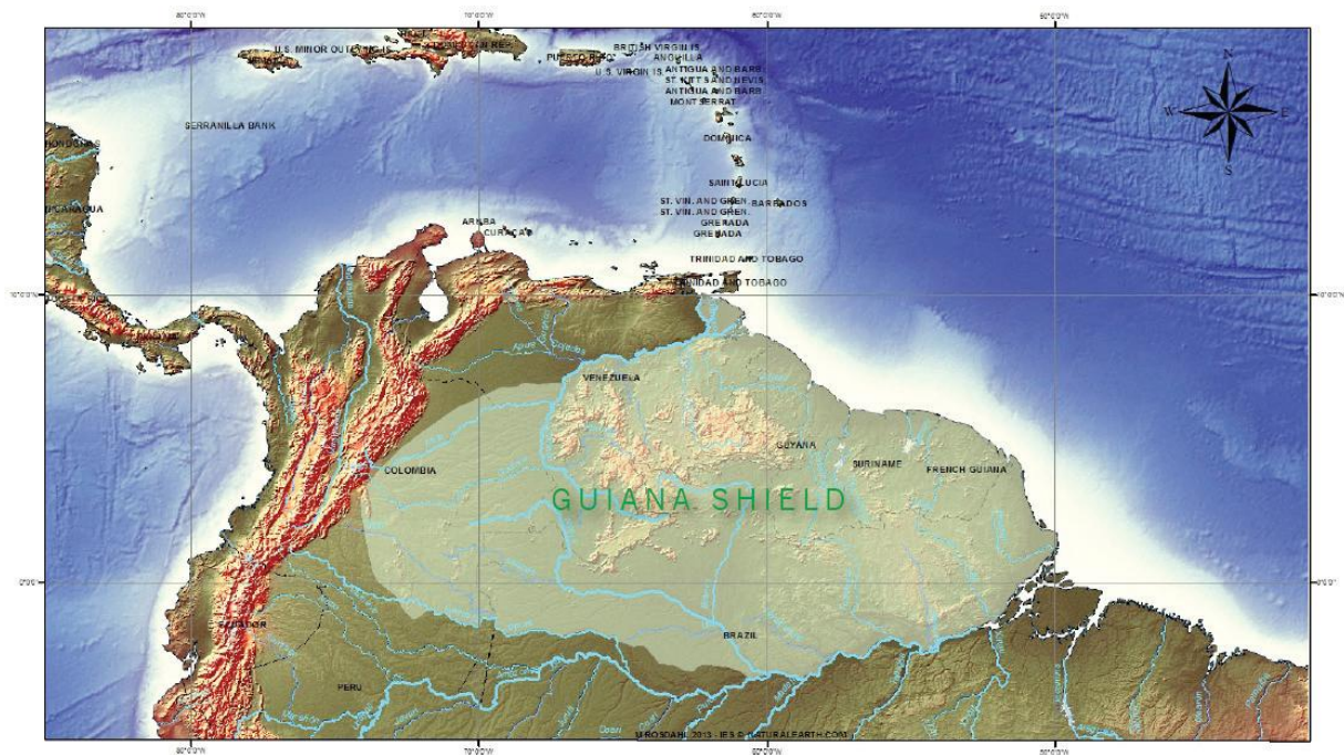
Figure 1: The Guiana Shield

Beyond that it is a region with still large numbers of indigenous communities who act as guardians of these tremendous ecological wealth. 5