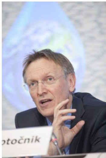
Janez Potočnik (European Commissioner for the Environment)